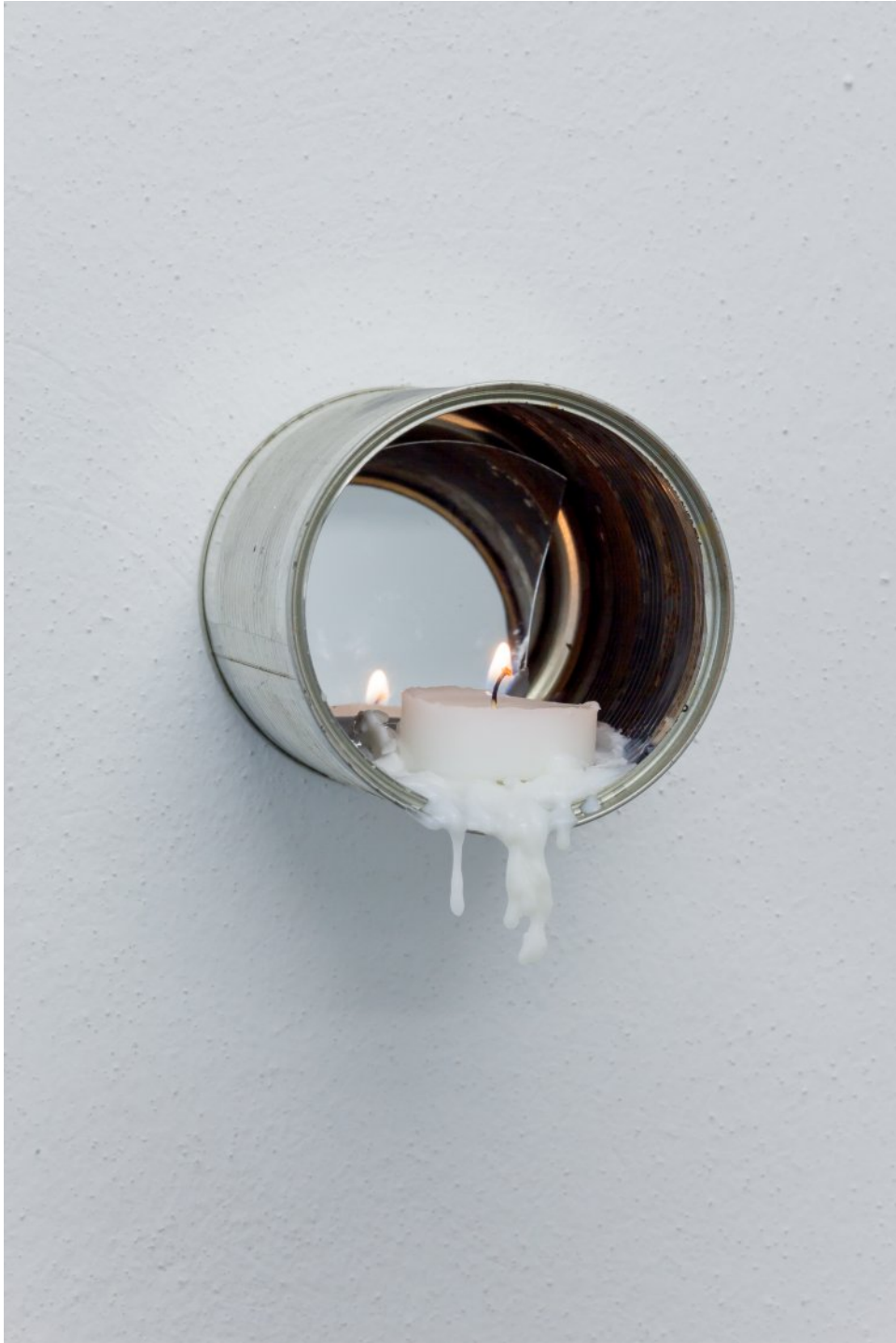
me's - can, candle, mirror, 8x8x11 cm, 2018 private collection