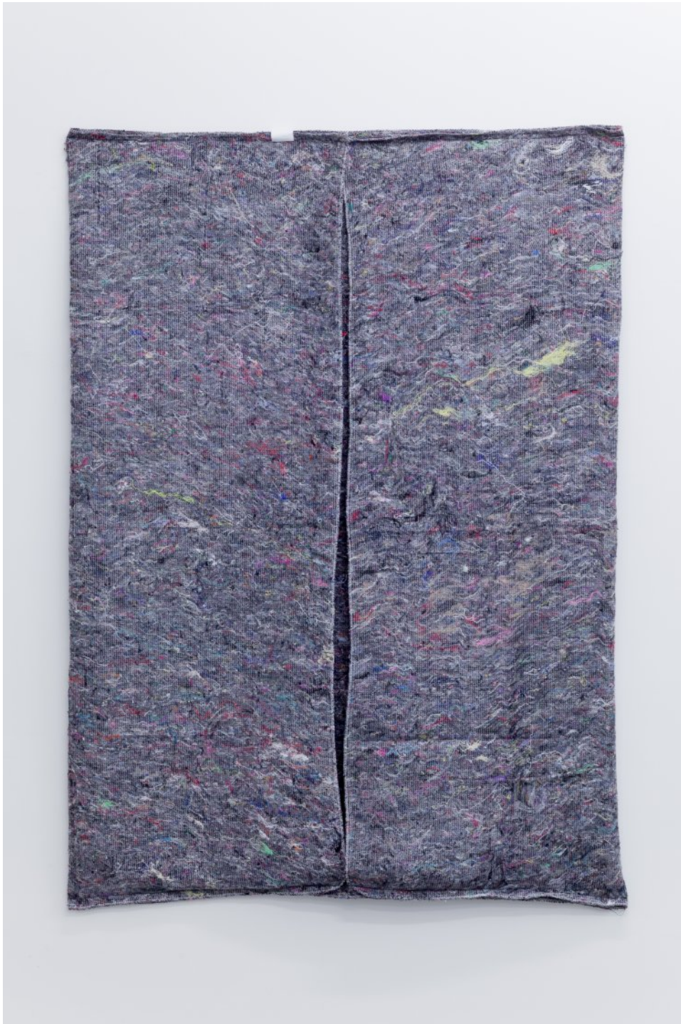
me - moving blanket, yarn, 145x95 cm, 2019 Edition of 3

felt with remaining threads used to move gatefolded for a opening and it muffels the room a little